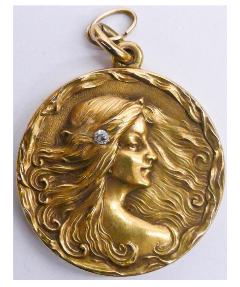
This 1½" long Art Nouveau 14k gold and diamond locket, with an old "ACS" monogram on the back and marked 14k on the interior, brought $937.50 (est. $100/300).