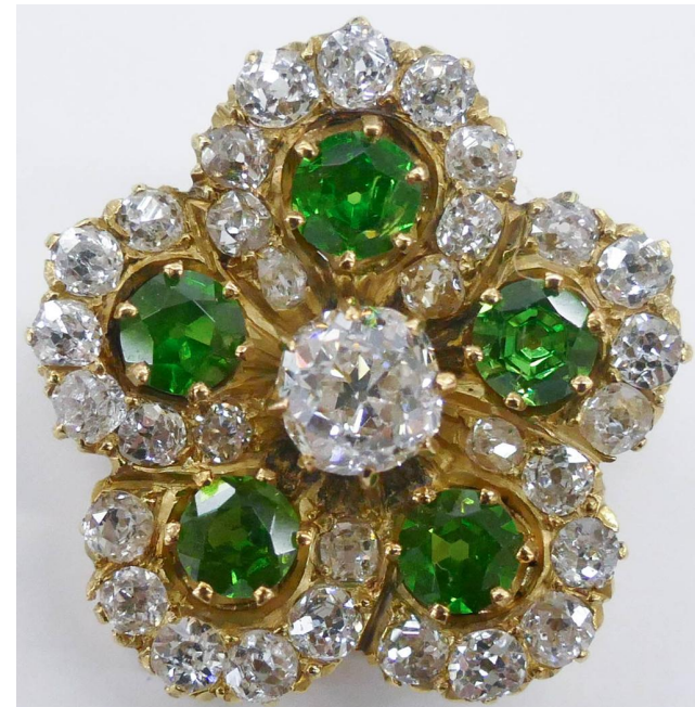
This unmarked Edwardian 1" long demantoid garnet, diamond, and 14k gold brooch with five round-cut demantoid garnets weighing a total of .75 carats, a central .7-carat old-mine-cut diamond, and 31 old-mine-cut diamonds weighing a total of approximately 1.55 carats sold for $2000 (est. $400/800).