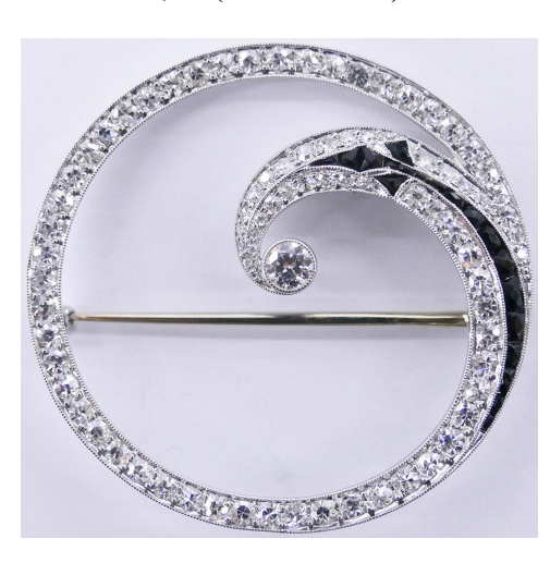
This Art Deco 1½" long diamond, black onyx, and platinum brooch with one brilliant-cut center .18-carat diamond and 88 single-cut diamonds weighing .005 to .3 carats each is unmarked, though likely French. It sold for $1750 (est. $500/1000).

This Art Deco 7" long emerald, diamond, and platinum bracelet with 27 rectangular step-cut emeralds weighing approximately 12 carats came with a 2017 Northwest Gemological Laboratory (NGL) appraisal. It brought $8125 (est. $3000/6000).