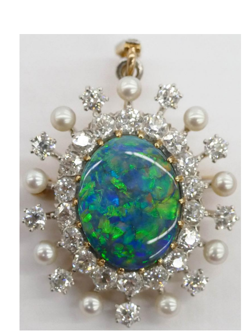
This 1½" x 1" unmarked black opal and diamond pendant brooch is centered by a cabochon-cut solid black opal in a bright display of green, violet, and orange medium-block flash. Twenty-seven old-European-cut diamonds weighing approximately 2.3 carats and nine nearround silver-white pearls, averaging 3 mm in diameter each, complete the piece. With a 2017 appraisal from Northwest Gemological Laboratory (NGL), it sold for $5000 (est. $1500/2500).

This unmarked Art Nouveau 3¼" x 1¼" flower brooch with a central ovalcut pink spinel of .3 carats surrounded by white enameled petals and with a naturalistic engraved stem in 14k gold realized $531.25 (est. $200/400).